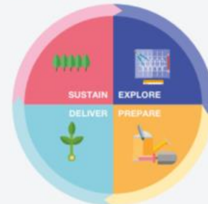
School Implementation Process

The EEF's School's Guide to Implementation offers guidance applicable to any school improvement decision, based around this implementation cycle: